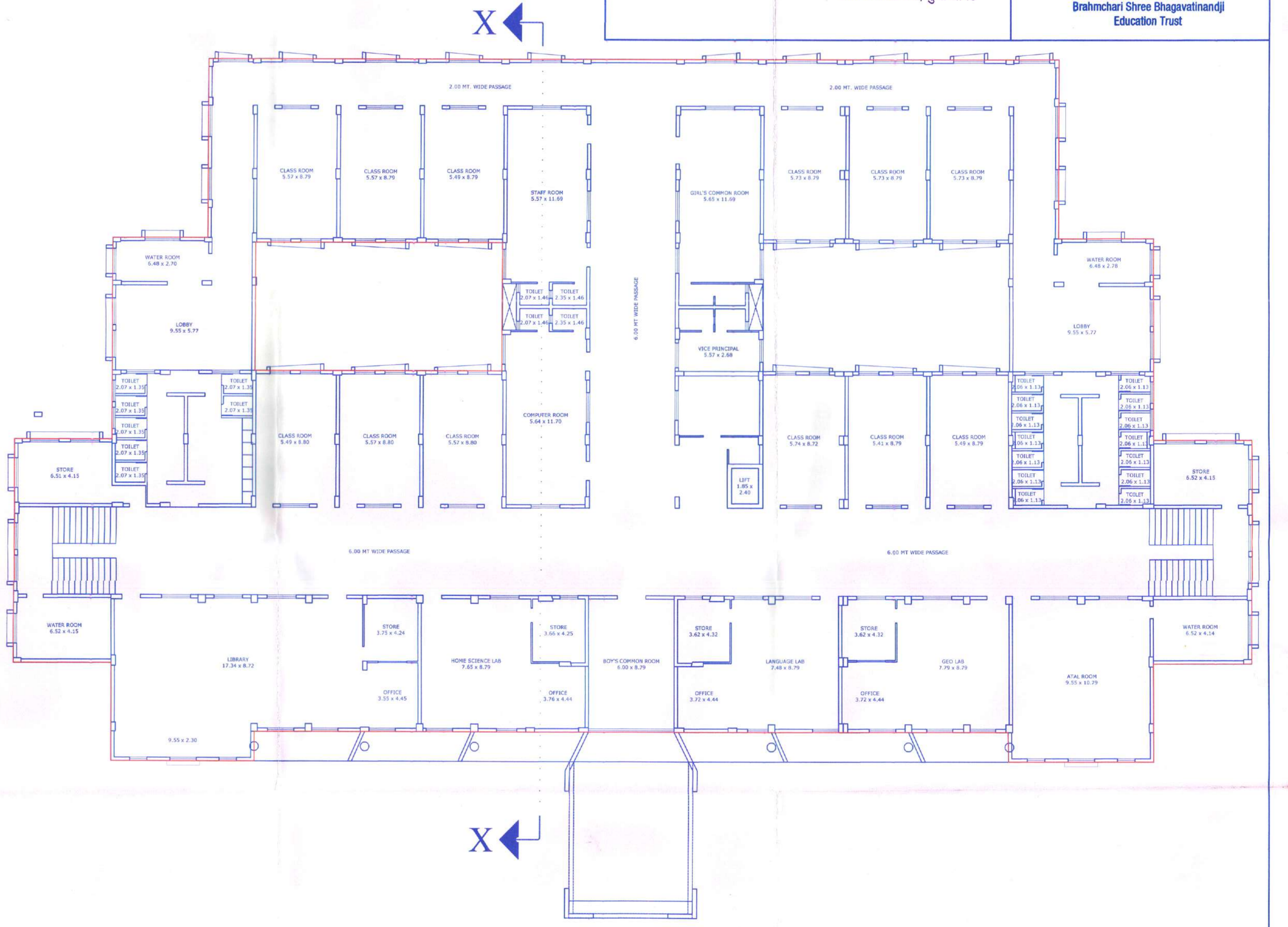
SECOND FLOOR PLAN (1:200)