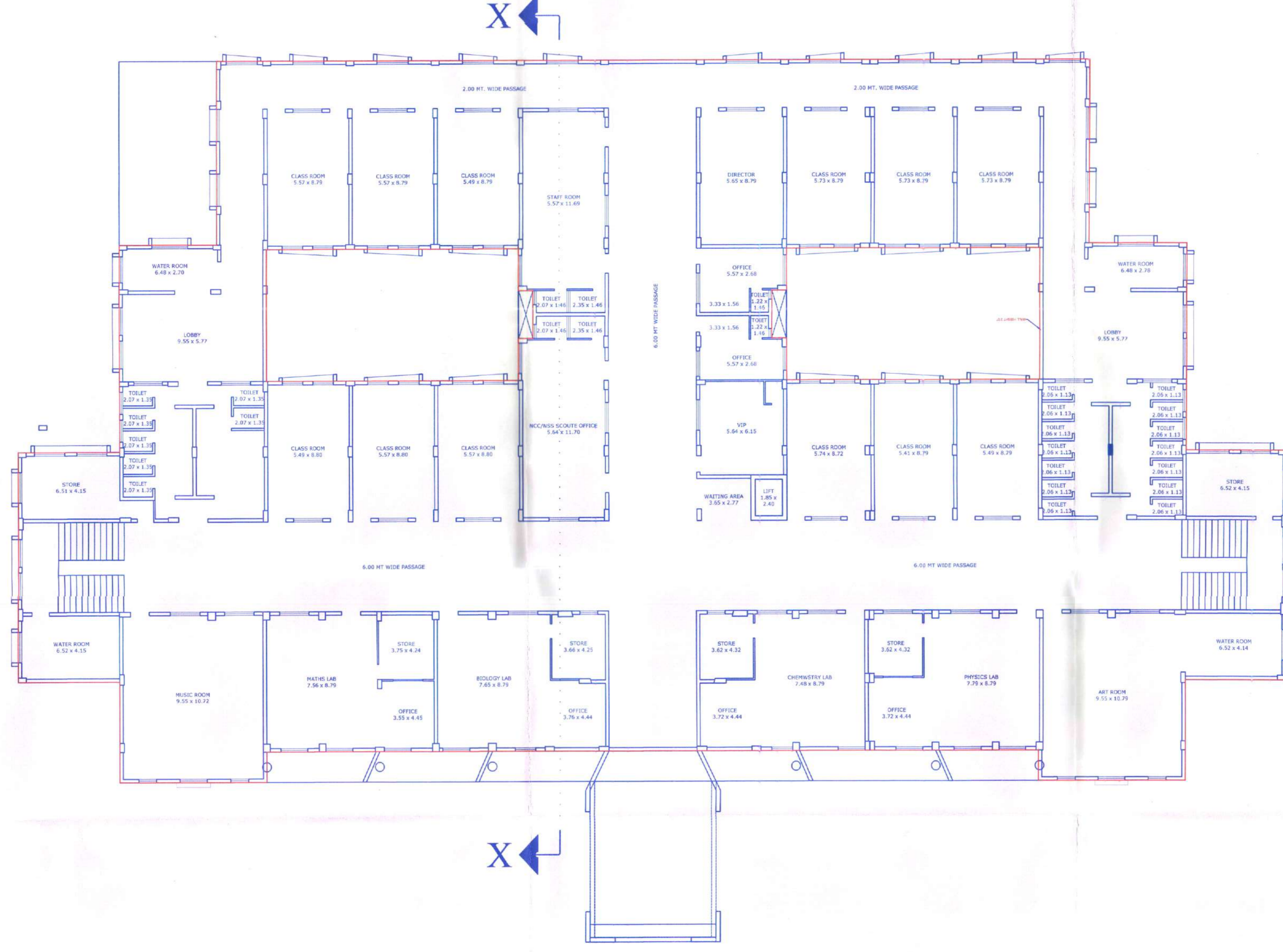
FIRST FLOOR PLAN (1:200)